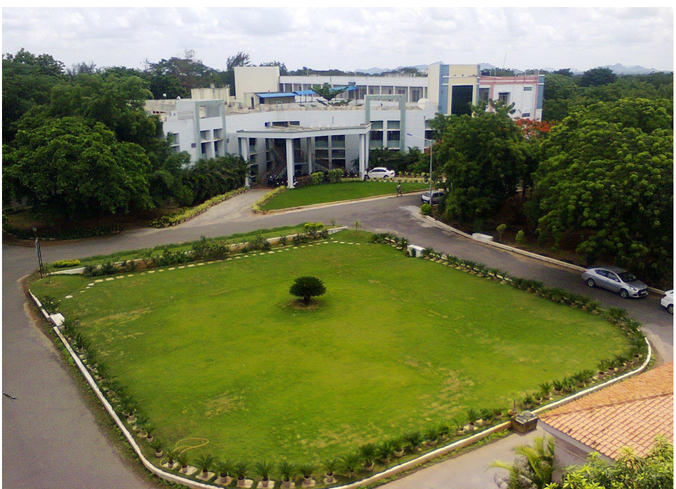
FLORA IN THE CAMPUS IS IN ABUNDANCE AND FOUND EVERYWHERE